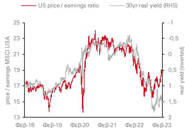
Chart 2: Equities' valuation gap with bonds has increased

Past performance is not a reliable indicator of future performance.